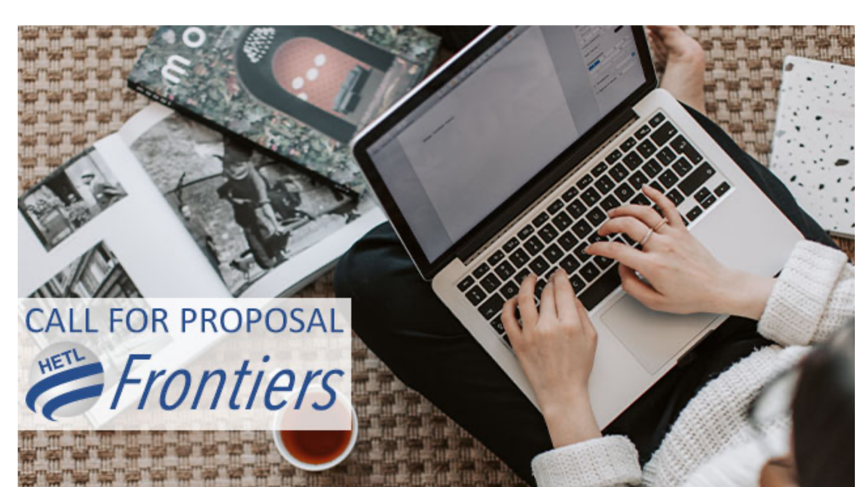
Topic: Web 4.0 - a new remodelling in education

HETL Frontiers is a new peer-reviewed magazine committed to publishing concise, high-quality magazine-style articles on cutting-edge issues and topics in higher education. We are accepting papers on the impact of Web 4.0 on education, and more specifically, how Web 4.0 is being applied in education. Potential topics may include, but are not limited to, the following: